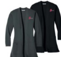
Port Auth Ladies Long Pocket Cardigan Ladies Item #LK5434