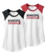
Alternative Ladies Vintage Tee Ladies Item #AA5104