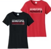
Port & Co Ladies Fan Favorite Tee Ladies Item #LPC450