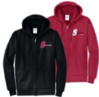
Port & Co Full Zip Hooded Sweatshirt Youth Item #PC90YZH • Adult Item #PC78ZH