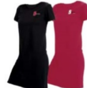
US Ladies T-shirt Dress Ladies Item #US401