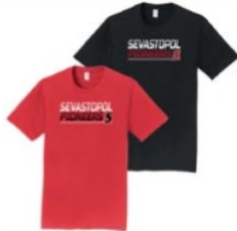
Port & Co Fan Favorite Tee Youth Item #PC450Y • Adult Item #PC450