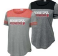
Sport-Tek Ladies Fan Tee Ladies Item #LST403