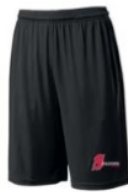
Sport-Tek Pocket Shorts Youth Item #YST355P • Adult Item #ST355P