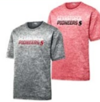
Sport-Tek Electric Tee Youth Item #YST390 • Adult Item #ST390