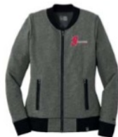
New Era Ladies Baseball Full Zip Ladies Item #LINEA503