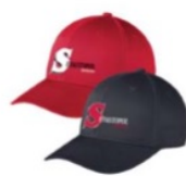
Port Auth Snapback Twill Cap Item #C801