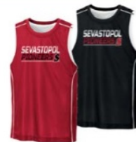
Sport-Tek Sleeveless Tee Youth Item #YT555