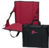
Port Auth Stadium Seat Item #BG601