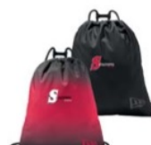
New Era Game Day Cinch Bag Item #NEB600