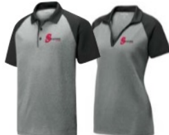
Sport-Tek RacerMesh Polo Adult Item #ST641 • Ladies Item #LST641