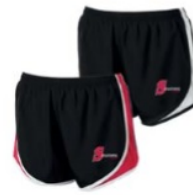
Sport-Tek Ladies Shorts Ladies Item #LST304