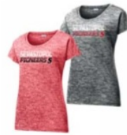
Sport-Tek Ladies Electric Tee Ladies Item #LST390